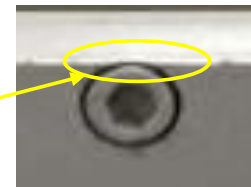
Flatten rough surface